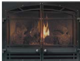
Sun Prairie available in black only