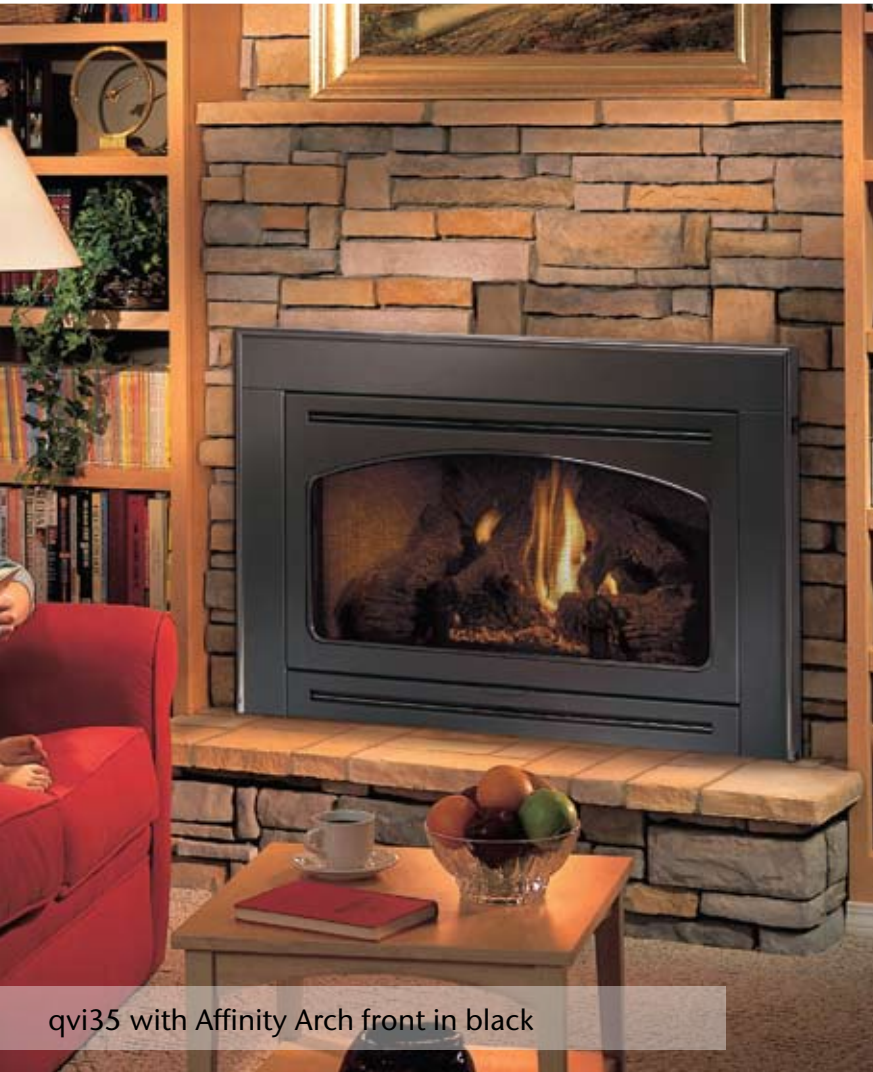
qvi35 with Affinity Arch front in black

The qvi35 direct vent gas insert offers the look and feel of a real wood fire with ceramic fiber logs and glowing ember bed. With a choice of three decorative fronts and high heat output and efficient advanced flame technology, the qvi35 is an excellent addition to any home.