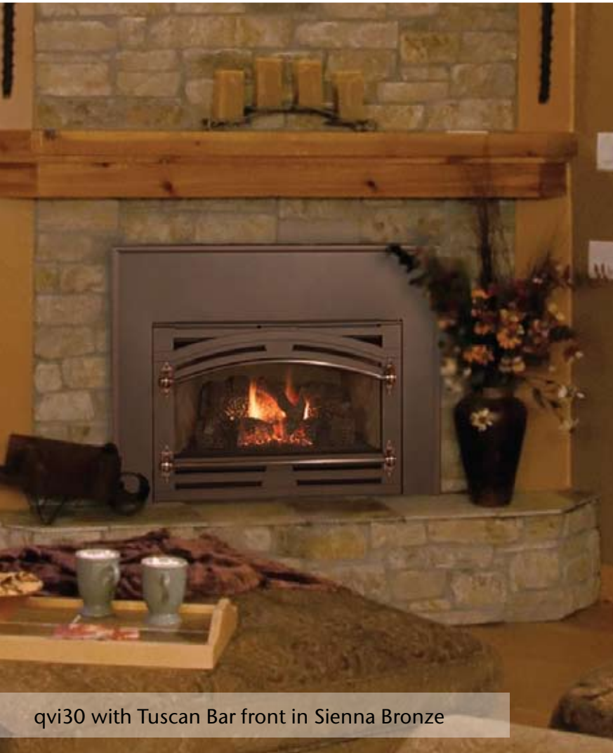
qvi30 with Tuscan Bar front in Sienna Bronze

The qvi30 direct vent gas insert features a ceramic brick firebox framing the realistic fire with large flames and glowing ember bed. Easy access to controls allows the fan speed, flame appearance, and heat output to be adjusted. Complete the qvi30 with a wide selection of available fronts in a range of styles, finishes, and colors that will complement any décor.