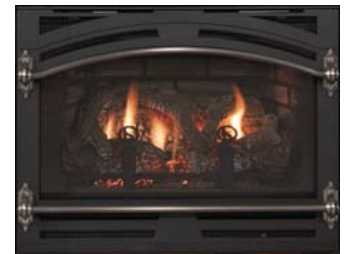
Tuscan Bar available in black with antique pewter accents and sienna bronze with antique copper accents