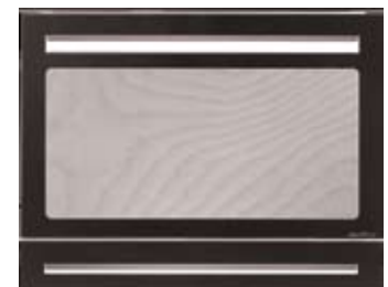
Decorative Front available in black only