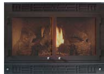
Town Square available in black only

IMPORTANT - READ BEFORE INSTALL! Refer to the Owner/Installation Manual for complete clearance requirements and specifications. The images and descriptions in this brochure are provided to assist you in product selection only. Quadra-Fire is a registered trademark of Hearth & Home Technologies. Product specification and pricing subject to change without notice. *Heating capacity rating is to be used as a guideline only. Actual performance may differ slightly due to climate, building construction and condition, amount and quality of insulation, location of the heater, and air movement in the room.