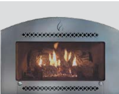
Remington available in black, gold and satin nickel.