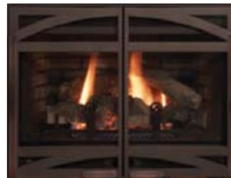
Tudor Panel available in black, sienna bronze, black with antique pewter accents and sienna bronze with antique copper accents