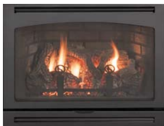
Affinity Arch available in black only