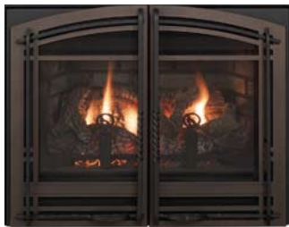
Chapel Hill available in black, hammered pewter and sienna bronze